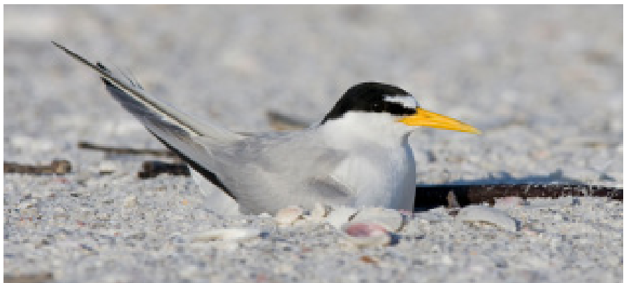
Least tern