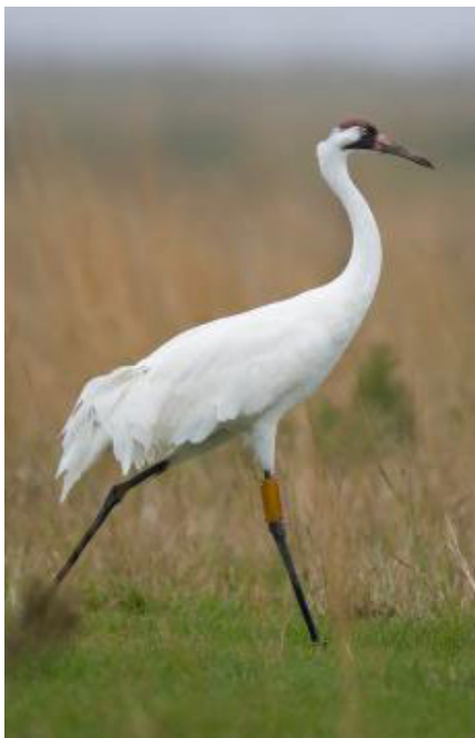
Whooping Crane