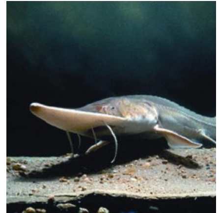
Pallid Sturgeon

The PRRIP is being implemented in an incremental manner, with the First Increment covering the 13-year period from 2007 through 2019. There are ambitious goals during the first increment of the Program, including major water management changes (e.g. re-regulating existing flows and adding to flows through conservation and acquisition), acquisition and restoration of 10,000 acres of Central Platte River habitat for the species in Nebraska, and a robust Adaptive Management component of the Program to learn more about species recovery needs.