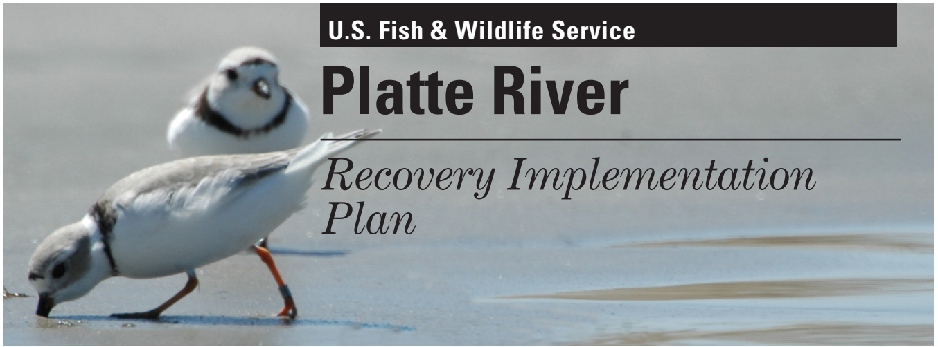
Piping plover