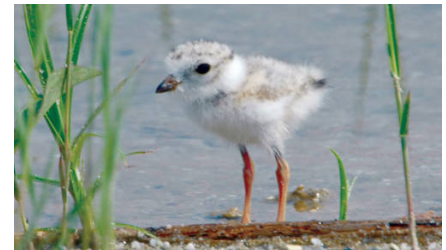
Piping plover chick